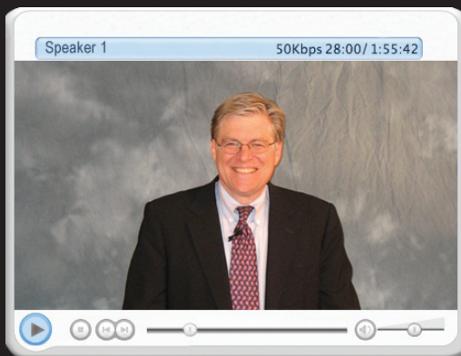
CLE programs are available online, anytime.

The combination of extensive knowledge and experience presented by leading attorneys and a high quality recording session, artistic postproduction and today's internet technology results in the most convenient MCLE accredited CLE program available.